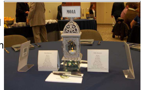
Lighting the Way Home