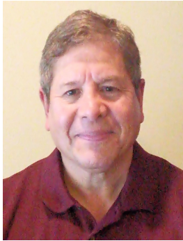
President Ivan Adames

Winston Churchill said, “Success is not final, failure is not fatal: It is the courage to continue that counts.” The continuing efforts following the Consolidated Veterans Coalition Day on Capitol Hill in Nashville, has succeeded in repealing the Income-Cap portion of legislation for disabled veterans on property taxes. We, along with the Montgomery County Veterans Coalition, are setting plans for a 2 nd Consolidated Veterans Coalition Day on February 8, 2017 .